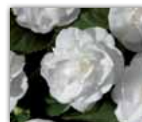
Double Vision White