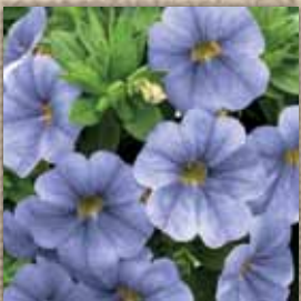
Tsunami Light Blue – Baby blue with a yellow throat.