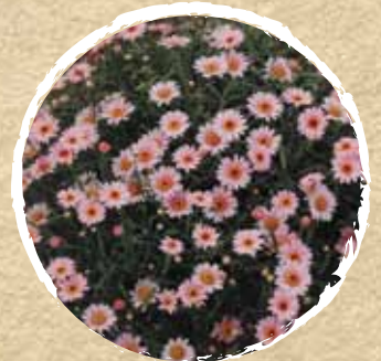
Sassy Pink – Beautiful pink single flowers.