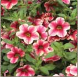
Strawberry Shortcake – Red and white bicoloured flowers.