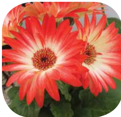
Gerbera Sunrise – Produces large vibrant fiery orange-red outer petals, which fade to lemon, and a red-yellow centre. Flowers stand strong on sturdy stems making it a standout in pots, planters or the garden.