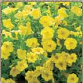
Tsunami Yellow – Stunning bright yellow.