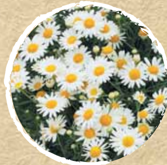
Sassy White – Pure-white single flowers.