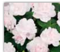
Double Vision Apple Blossom