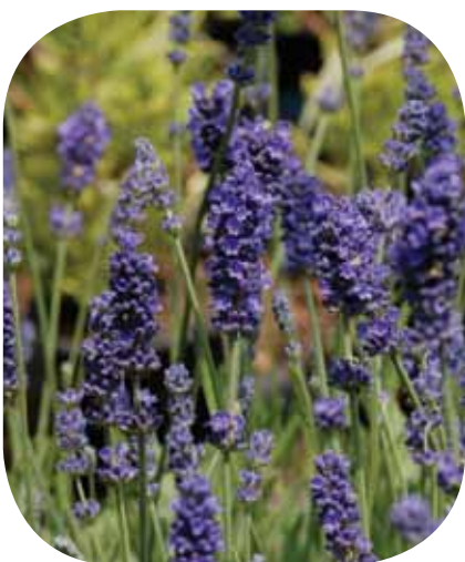
Lavender Sweet Romance – An intensely fragrant lavender with grey-green foliage, which forms compact mounds, topped with plump, rich violet-purple flowers in summer. Great perennial for rock, scented or herb gardens.