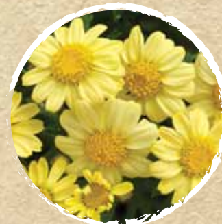
Sassy Yellow – Fresh buttery-yellow single flowers.