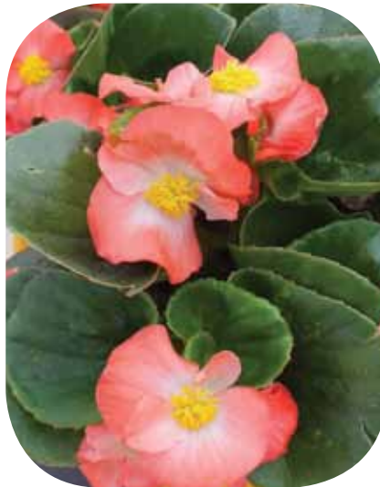
Begonia Olympia Flame – The world's first orange bedding begonia. Bright-orange blooms on compact, glossy green foliage. Ideal for garden borders or pots. Frost tender and shade loving.