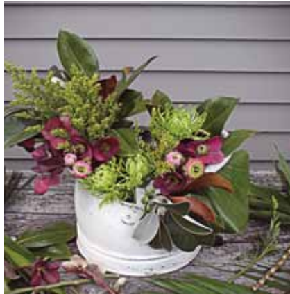
Layer two uses smaller flowers. This layer creates uniformity for the entire design.