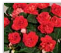
Double Vision Red