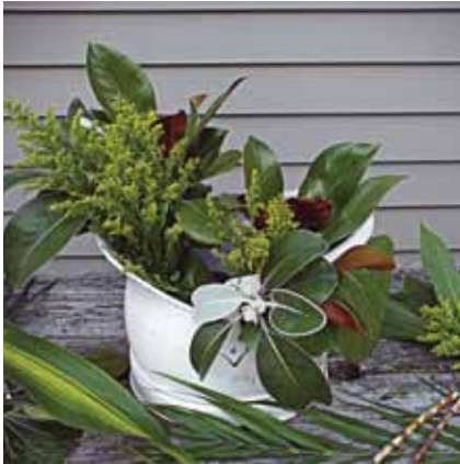
Layer one uses foliage, berries or vines. These give the arrangement texture and movement.