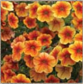
Tsunami Firestorm – Scorching tones of bright orange with deep-bronze veins.