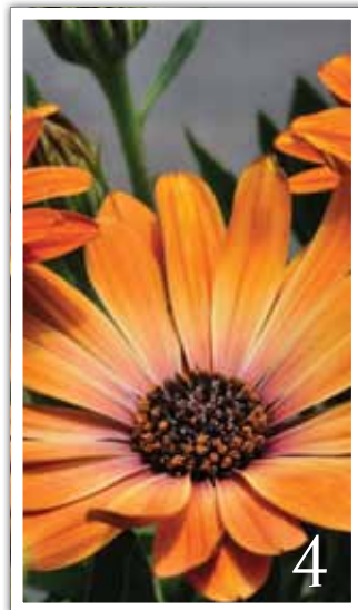
1. Afrikaans Lavender – Offers cool shades of lavender pink with a dark eye. 2. Afrikaans Pure White – Pure snow-white flowers with a yellow eye. 3. Afrikaans Purple – Bold, deep-purple flowers with a dark eye. 4. Afrikaans Sunrise – Superbly unique with bright shades of pure orange and a crimson eye. 5. Afrikaans Yellow – Bright sunny shades of pure yellow with a crimson eye.