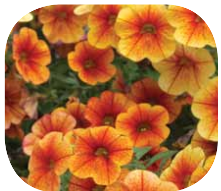
Calibrachoa Tsunami Firestorm – Non-stop flower power through spring and summer is easy with the Calibrachoa and its stunning long-lasting, bright-orange flowers, which cascade beautifully from baskets or containers.

Note: Sorry for the inconvenience with some varieties not being available until October. We are happy to put your name in our order book and call you when they become available.