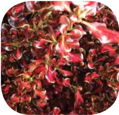
Coprosma Pacific Sunset – A striking glossy leaf consisting of a vivid red centre set against a burgundy/chocolate-brown margin. Grows to 1m tall. Available October.