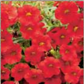
Tsunami Red – Bright red with a yellow throat.