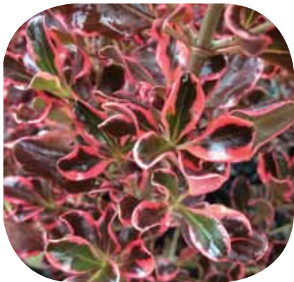
Coprosma Pacific Sunrise – An exceptional trendsetter with chocolate brown foliage and hot-pink highlights. Stunning in pots, growing to 1m tall. Available October.