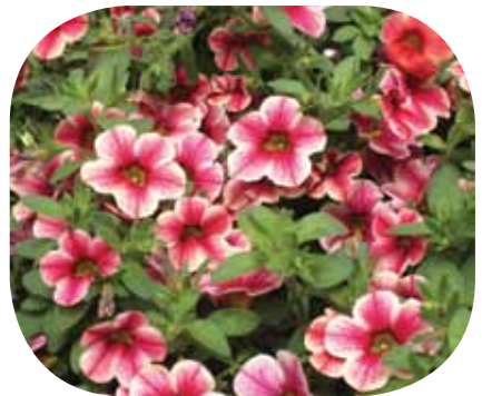
Calibrachoa Strawberry Shortcake – Stunning long-lasting, red and white bicolour flowers, which cascade beautifully from baskets or containers. Performs throughout spring, summer and autumn.