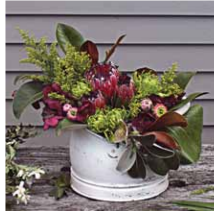
Layer three uses large flowers. These create the focal point of the arrangement.

Although there are principles to floristry design, as a home florist you don't need to feel ruled by them. Trust that the flower and foliage from your home will guide you to create your own, individual masterpiece.