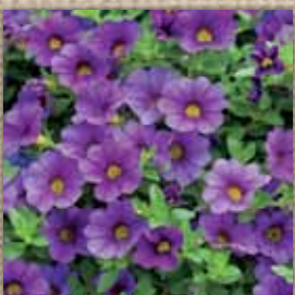
Tsunami Blue – Bright blue with a yellow throat.