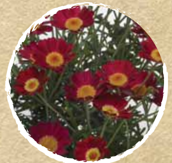
Sassy Red – Bright red single flowers.