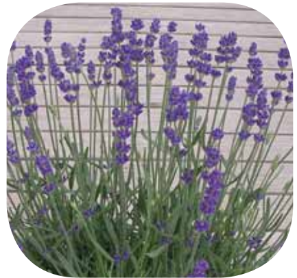
Lavender Blue Chips – Exciting, beautifully scented deep-blue flowers open into generous flower heads, which are ideal for picking as they will retain their colour when dried.