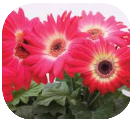
Gerbera Sunset – If ever there was a tailor-made flower for bold, beautiful colour, this gerbera is it, with its cooler rose-pink outer petals, which fade to lemon, and a pink-yellow centre.