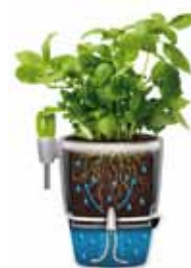
Revolutionary watering system for healthy herbs